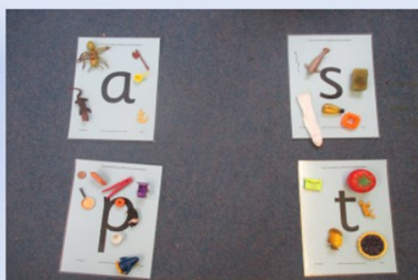
Sorting objects that begin with s a t p i n