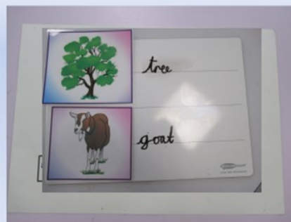
Using phase 3 sounds in spelling